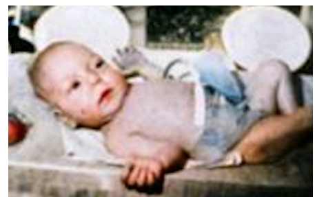
Before and after 44 days of TPN